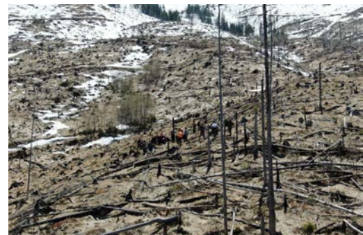
Saplings arriving on site in Groapele, our new planting site from 2021 / The scale of deforestation this area has suffered (bottom right)