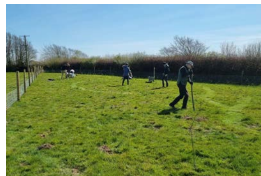
Nicoleta Carpineanu, FWF Founder and Liam Hayhow, Farm Under the Radar, planting the first oak sapling / Oak sapling flourishing (top right)