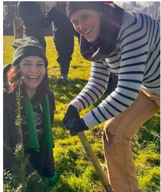
Planting our first trees in Sussex with our partners and the FWF team