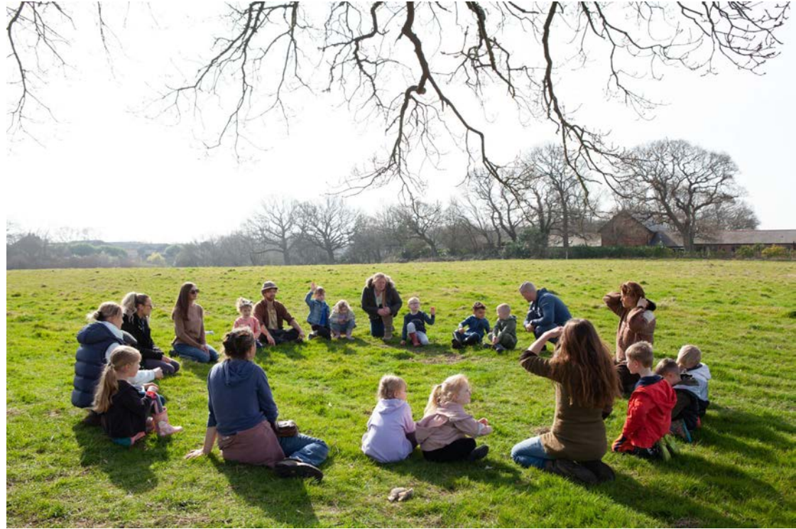
Community focus in all our projects