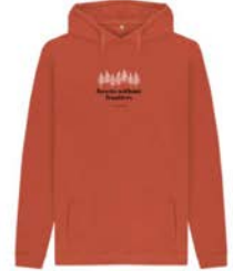
Forests Without Frontiers - Mens Forest Hoodie - Design Conscious Earthwear £42