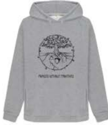
Acorn to Oak - FWF womens sweatshirt - design by artist Alexandra Dimitru £40