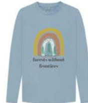
Forest Rainbow - Kids long sleeve Tee - Design Conscious Earthwear £19