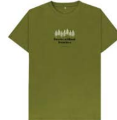
Forests Without Frontiers - Mens Forest Tee - Design Conscious Earthwear