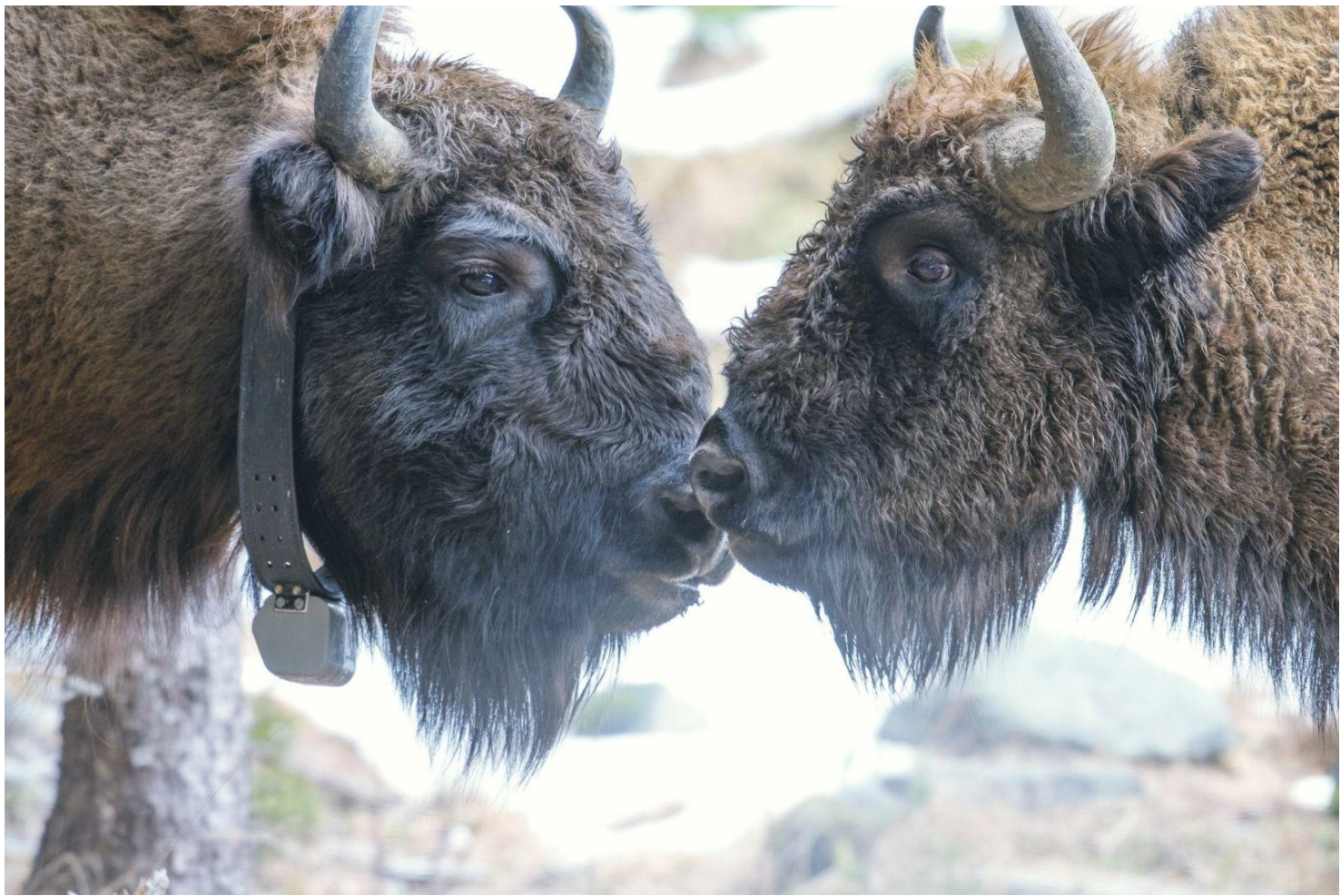
Bison in the Fagaras Mountains