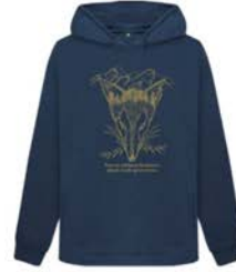
Forest Fox - FWF Womens sweatshirt - Design Conscious Earthwear £40