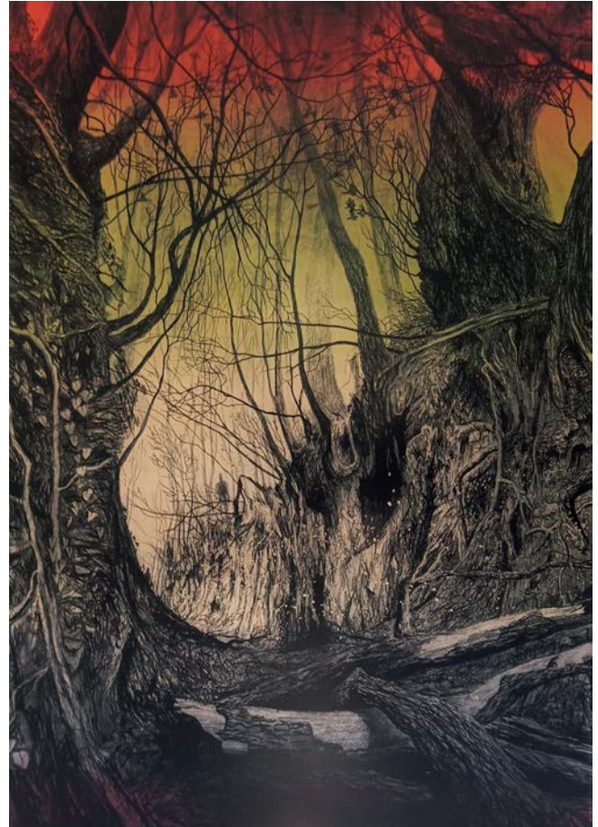
'Watching' - Limited Edition print by Stanley Donwood