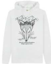
Forest Fox - Mens Hoodie - Design Conscious Earthwear £50