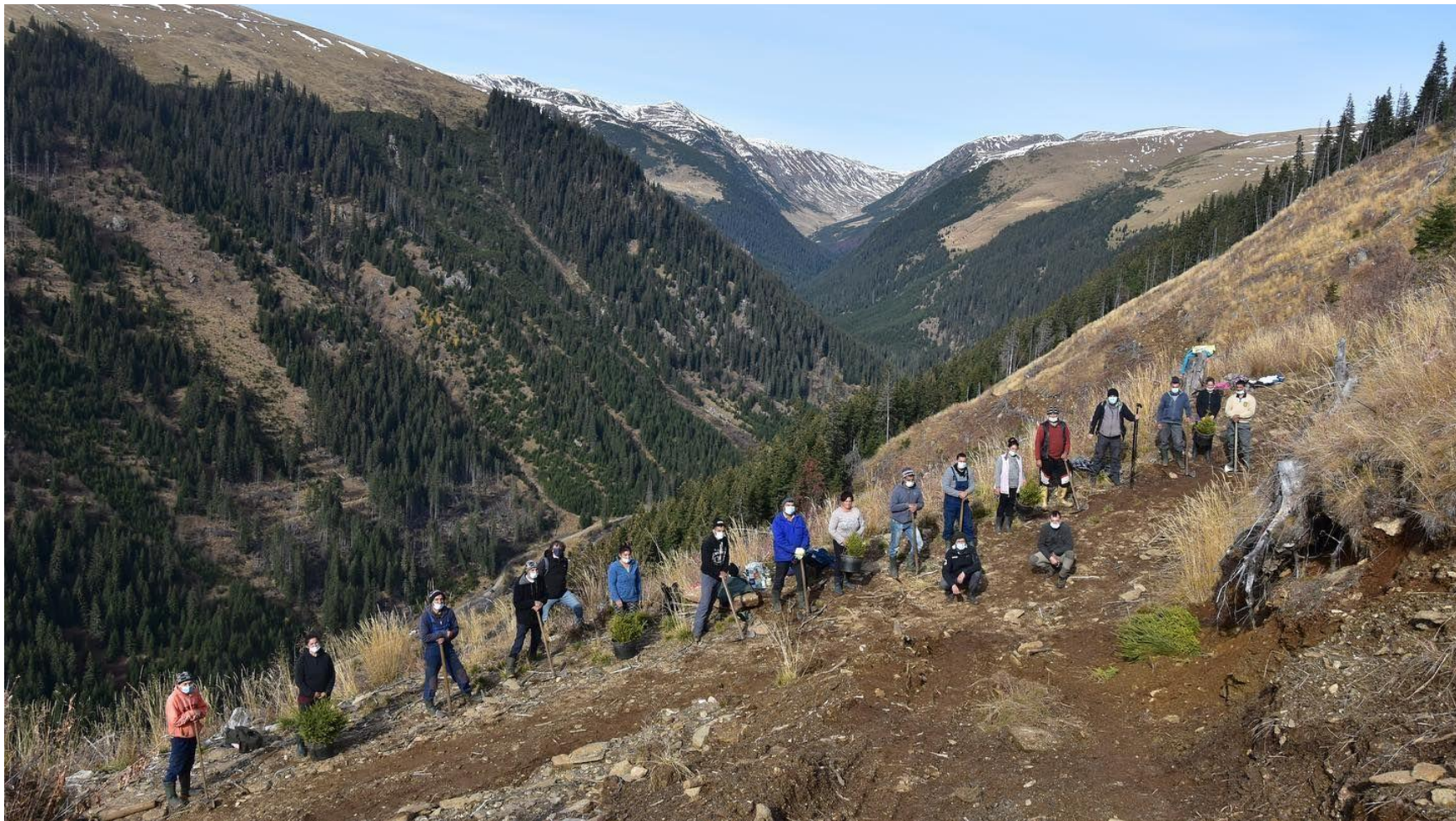
Workers in Valea Lunga, Fagaras Mountains, for the autumn plantation 2020 during the pandemic