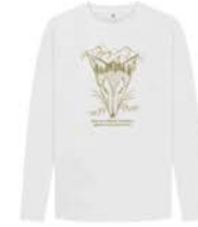
Forest Fox - Kids Long Sleeve Tee - Design Conscious Earthwear £18